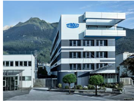
TYROLIT headquarters in Schwaz (Austria)

Headquartered in Schwaz (Austria), the family-owned business combines the strengths of being a part of the dynamic Swarovski Group with a century's worth of individual corporate and technological experience.