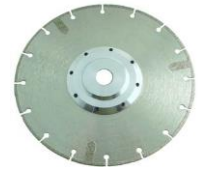
Turbo with lateral supports