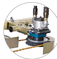
Standard hydraulic drive motor