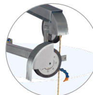
Flexible water supply

Safe application thanks to concealed wires. Easy handling thanks to intelligent design. Hydraulic or electric drive. Suitable for additional wall