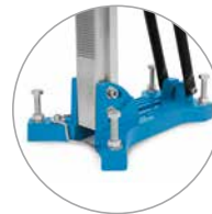
Compact dowel foot