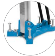
Compact dowel foot